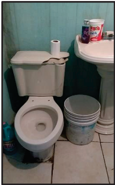
Bathroom/Shower/making it functional