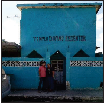
Outside of Church

also needs repairs on the outside. It will take several more weeks to get it all done, but God is good in providing the funds needed.